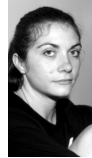
Cf 238 Misty May athlete