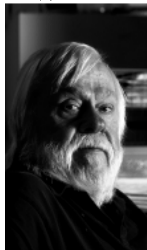
Cf 254 John Baldessari conceptual photographer