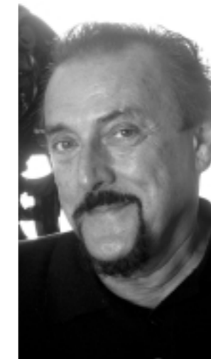
Cf 244 Philip Zimbardo social psychologist