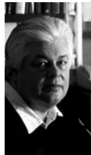
Cf 255 Paul Watson marine conservationist