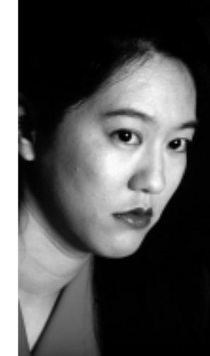
Cf 243 Iris Chang author