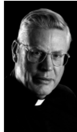
Cf 248 Ellwood Kieser producer/priest