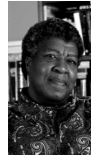
Cf 251 Octavia Butler author