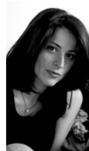
Cf 249 Deborah Faust actor