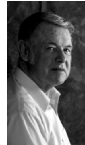
Cf 250 Bruce Murray planetary geologist